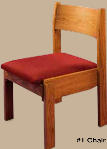
#1 Chair Wood Back

The Number 1 Chair is solid oak with wood back and either wood or an upholstered seat. It is designed to provide a more erect sitting position, making it a favorite for Choir Seating. The Number 1 Chair comes standard with front and rear bookracks. Optional items include ganging devices and snap on-snap off kneelers and solid wood seats and backs.