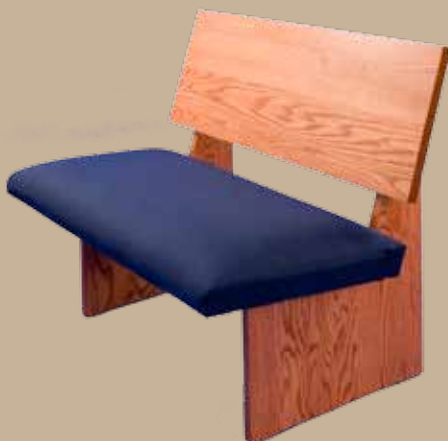
Double Portable Pew

The Portable Modular Pew combines the comfort of pew seating with the flexibility of chairs. They can be ordered in single, double and triple widths, and can be set side by side for continuous seating. Portable Modular Pews can be delivered assembled or they can be assembled in the field using eight bolts per pew. Portable Modular Pews can have brackets and kneelers installed.