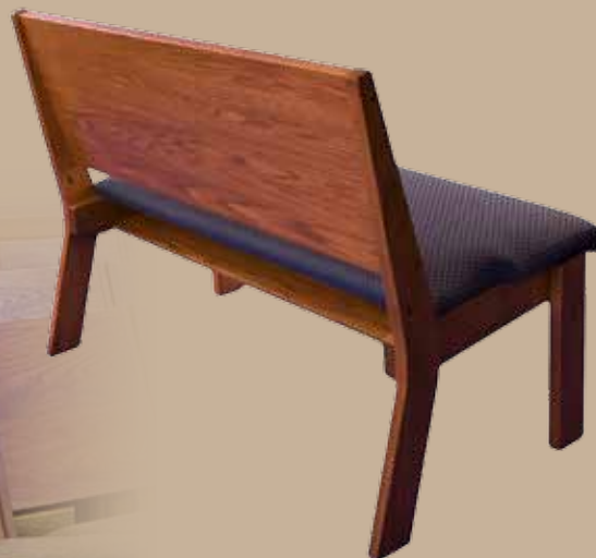
Super Chair II Double Rear