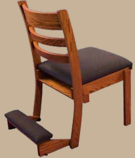
Ladder Back Chair Kneeler Down