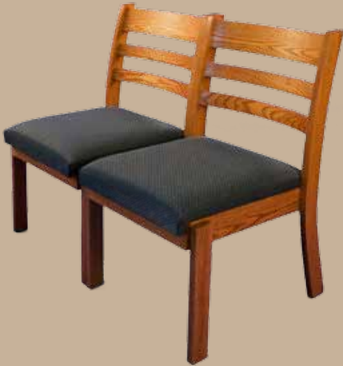
Ladder Back Chair Side by Side