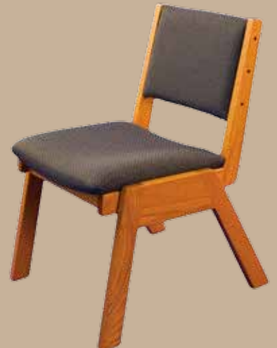
Omega 2 Chair

The Omega 1 and Omega 2 chairs blend the function of classic design and the durability of solid oak construction. The Omega chair provides a straight back and seat while the Omega 2 provides the sculptured look of contoured seats and backs. Both the Omega 1 and Omega 2 chairs are stackable, can be ganged and can have kneelers installed. The Omega 1 chair is available in single, double and triple widths, but because of the distinctive construction of the Omega 2 chair, it is only available in single width.