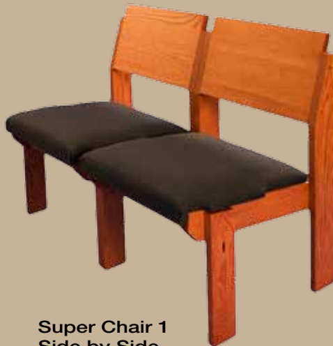
Super Chair 1 Side by Side