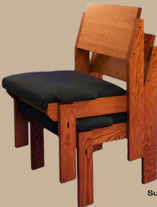
Super Chair 1 Stacked

The Super Chair is made with solid oak with wood back and either wood or an upholstered seat. It matches the look and feel, as well as the comfort, of pew seating. A row of Super Chairs resembles a pew. Super Chairs are used extensively where flexibility in seating is desired while retaining the look and feel of pews. The Super Chair comes standard with front and rear bookracks. Optional items include ganging devices and snap on-snap off kneelers. The Super Chair is available in single, double and triple widths.