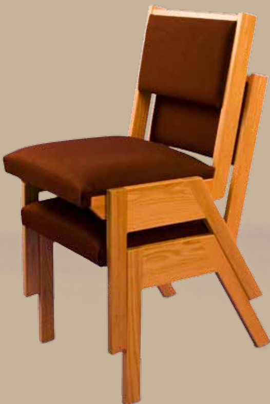
A Frame Chair Stacked

The A Frame Chair blends the function of classic design and durability of solid oak construction. The A Frame chair includes an upholstered seat and back, is stackable, can be ganged together and can have a kneeler installed. The A Frame Chair is available in single, double and triple widths.