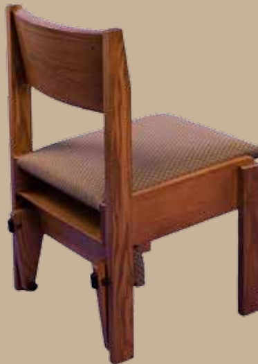
#1 Chair Kneeler Up