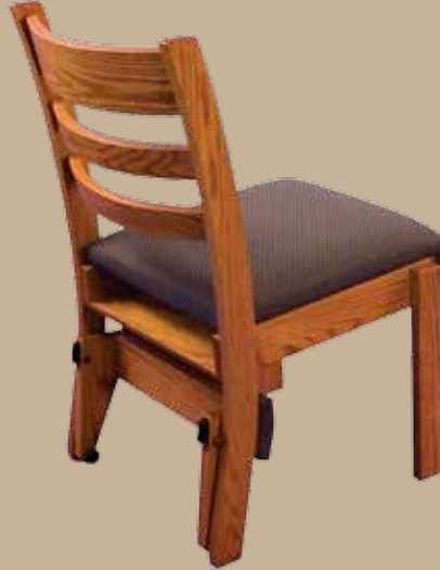
Ladder Back Chair Kneeler Up