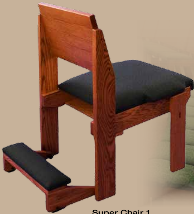
Super Chair 1 Kneeler Down