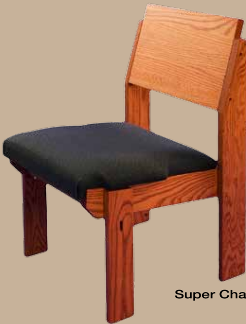
Super Chair 1