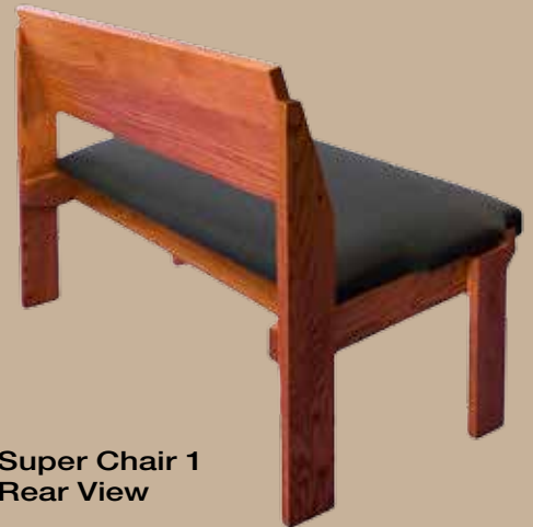
Super Chair 1 Rear View