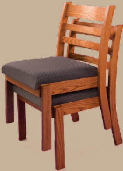
Ladder Back Chair Stacked