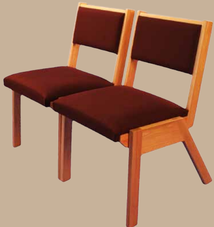
A Frame Chair Side by Side