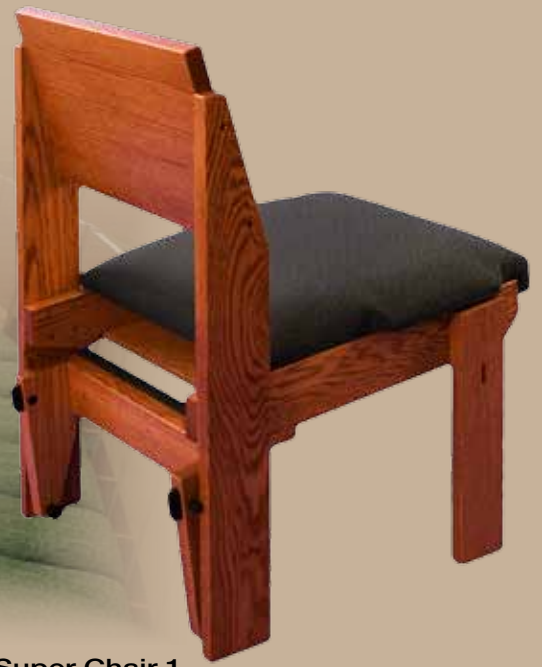
Super Chair 1 Kneeler Up