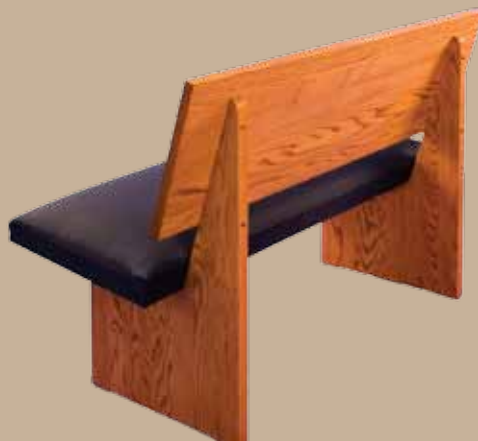
Double Portable Pew Rear View