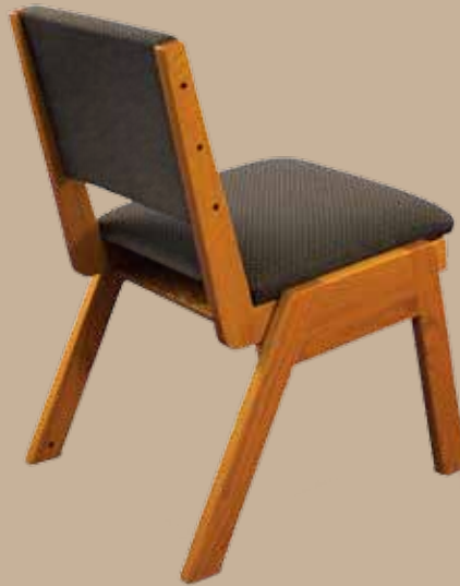
Omega 1 Rear View