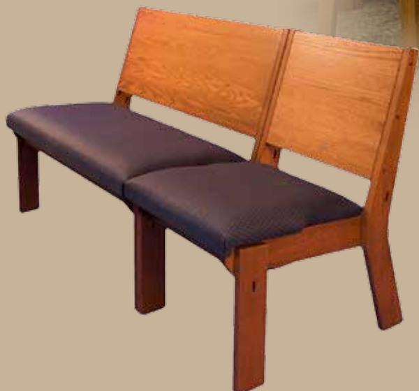
Super Chair II Single Double Side by Side