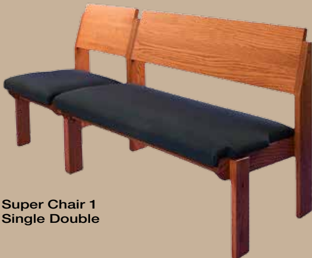
Super Chair 1 Single Double