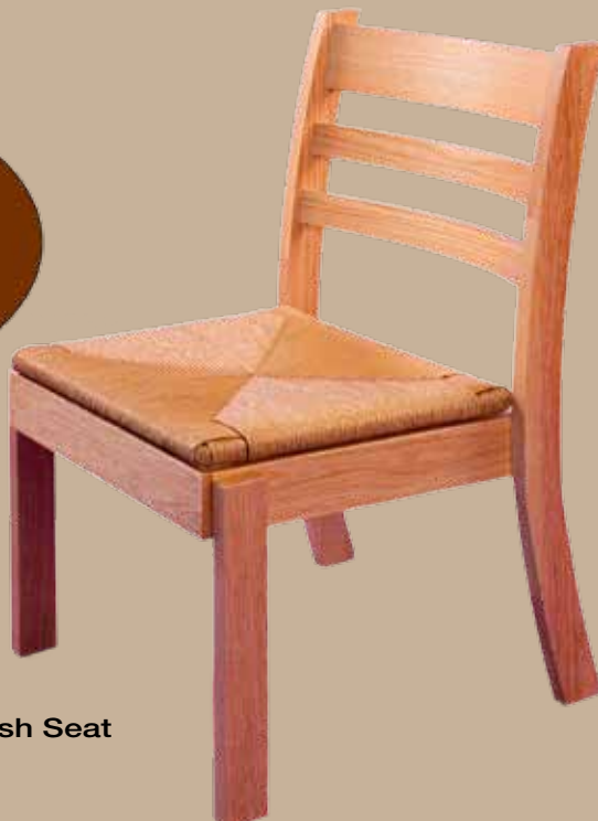
Ladder Back Chair Rush Seat

The Ladder Back Chair is made from solid oak with an open style wood back and either a wood or an upholstered seat. It offers the comfort of pew seating while having a contemporary look. The Ladder Back Chair comes standard with front and rear bookracks, and can be stacked. Optional items include ganging devices, snap-on, snap-off kneelers, solid oak contoured seats and natural rush seats.