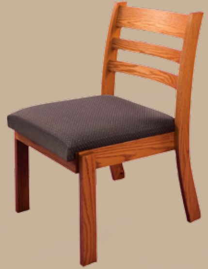
Ladder Back Chair