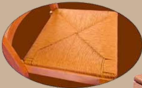
Ladder Back Chair Rush Seat Close Up