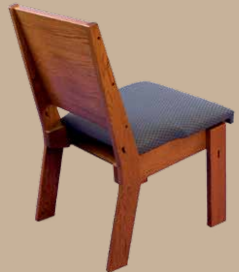
Super Chair II Rear

Super Chairs can be ganged together with a ganging clamp.