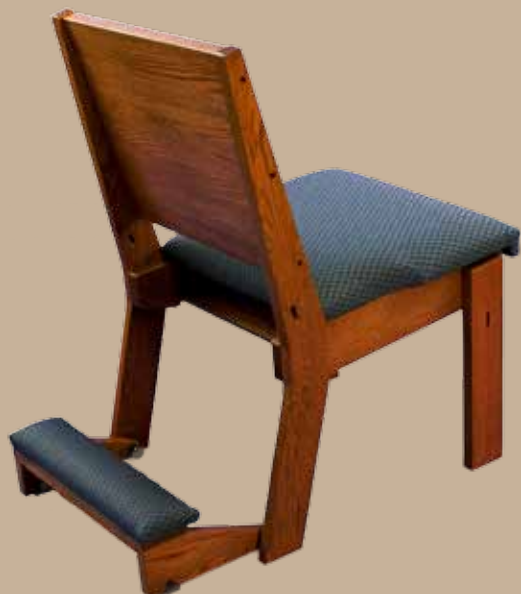
Super Chair II Kneeler Down

The Super Chair II is made with solid oak with wood back and either wood or an upholstered seat. It matches the look and feel, as well as the comfort, of pew seating. A row of Super Chair IIs resemble a pew. Super Chairs IIs are used extensively where flexibility in seating is desired while retaining the look and feel of pews. The Super Chair II comes standard with front and rear bookracks. Optional items include ganging devices and snap on-snap off kneelers. The Super Chair II is available in single, double and triple widths.