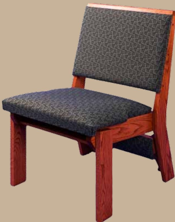
Super Chair II with upholstered seat and back.