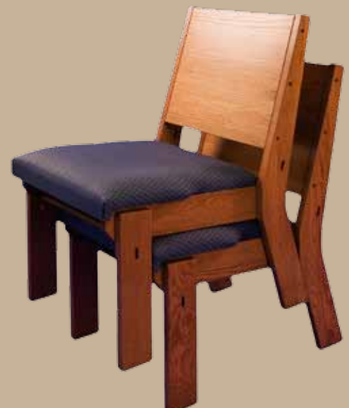
Super Chair II Stacked