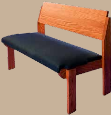
Super Chair 1 Double