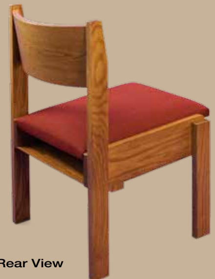
#1 Chair Wood Back Rear View

The Number 1 Chair is solid oak with wood back and either wood or an upholstered seat. It is designed to provide a more erect sitting position, making it a favorite for Choir Seating. The Number 1 Chair comes standard with front and rear bookracks. Optional items include ganging devices and snap on-snap off kneelers and solid wood seats and backs.