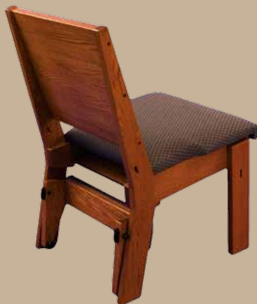
Super Chair II Kneeler Up

The Super Chair II is made with solid oak with wood back and either wood or an upholstered seat. It matches the look and feel, as well as the comfort, of pew seating. A row of Super Chair IIs resemble a pew. Super Chairs IIs are used extensively where flexibility in seating is desired while retaining the look and feel of pews. The Super Chair II comes standard with front and rear bookracks. Optional items include ganging devices and snap on-snap off kneelers. The Super Chair II is available in single, double and triple widths.