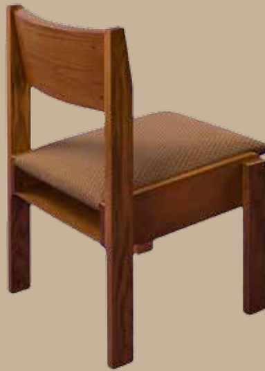
#1 Chair Rear View