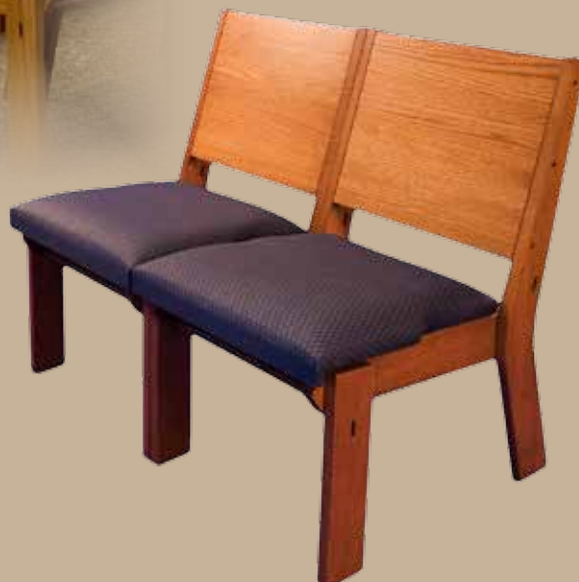
Super Chair II Single Side by Side