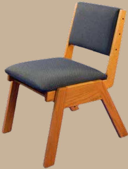
Omega 1 Chair