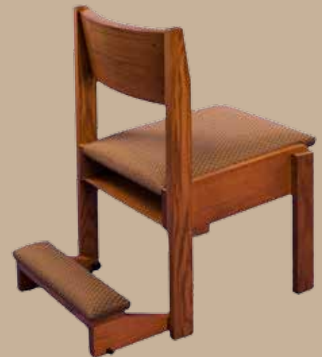
#1 Chair Kneeler Down