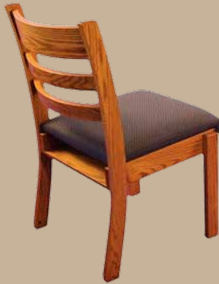
Ladder Back Chair Rear View