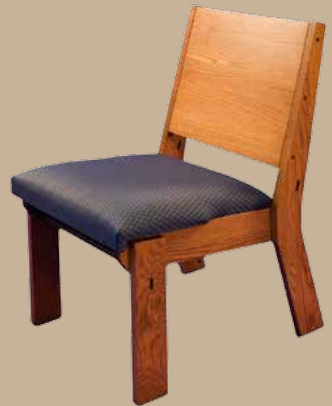
Super Chair II Front