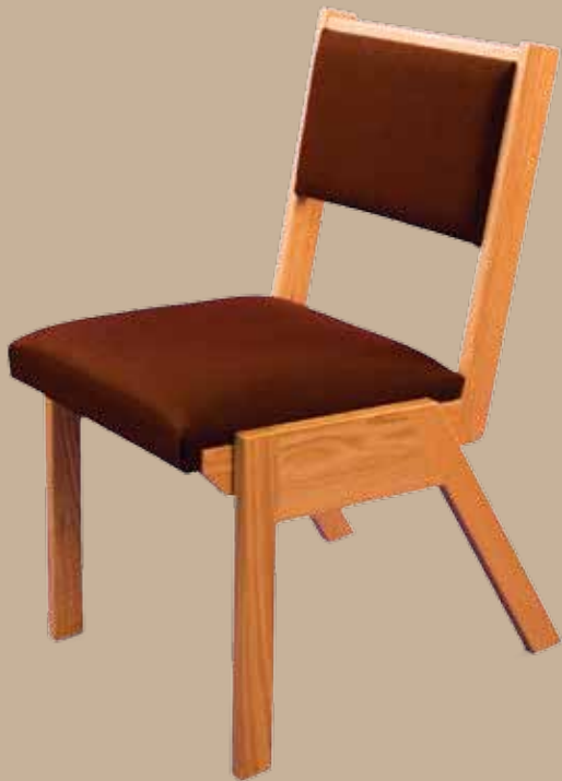
A Frame Chair