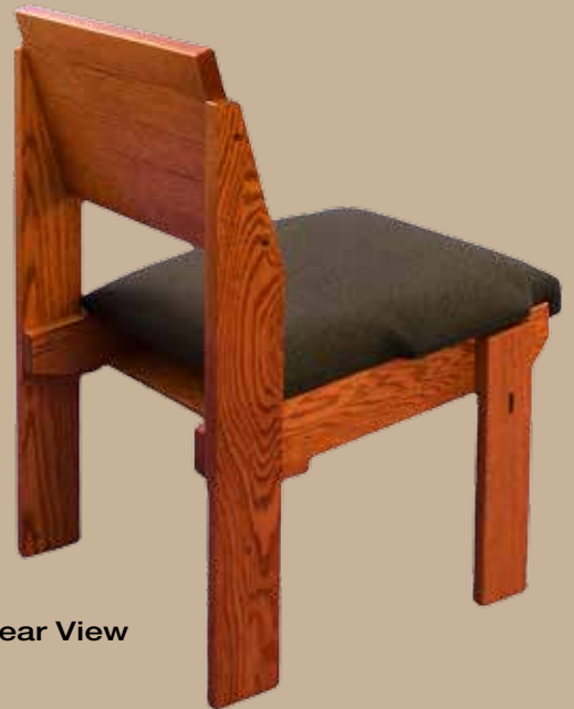
Super Chair 1 Rear View