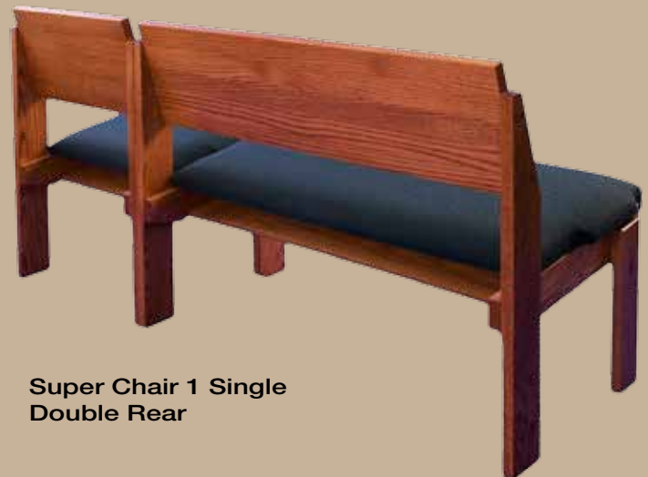
Super Chair 1 Single Double Rear