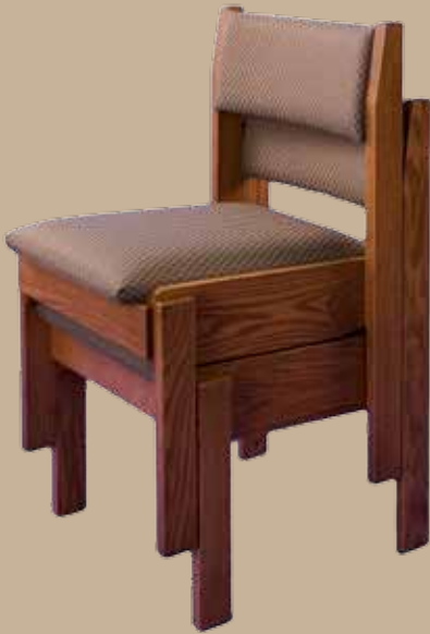
#1 Chair Stacked