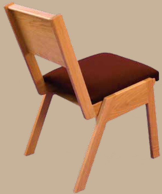
A Frame Chair Rear View

The A Frame Chair blends the function of classic design and durability of solid oak construction. The A Frame chair includes an upholstered seat and back, is stackable, can be ganged together and can have a kneeler installed. The A Frame Chair is available in single, double and triple widths.