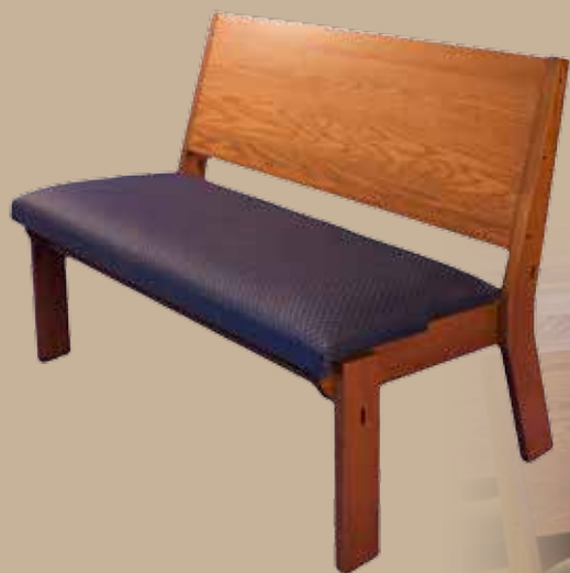
Super Chair II Double