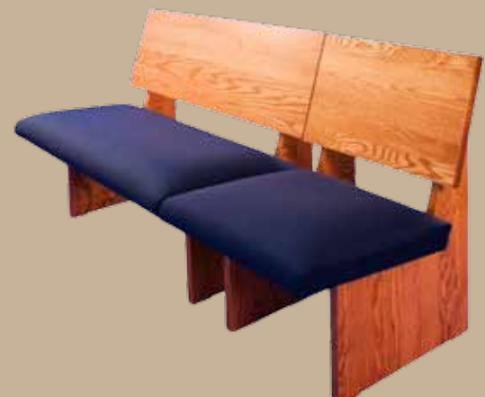
Single/Double Portable Module