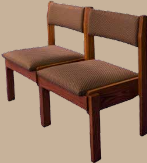
#1 Chair Side by Side