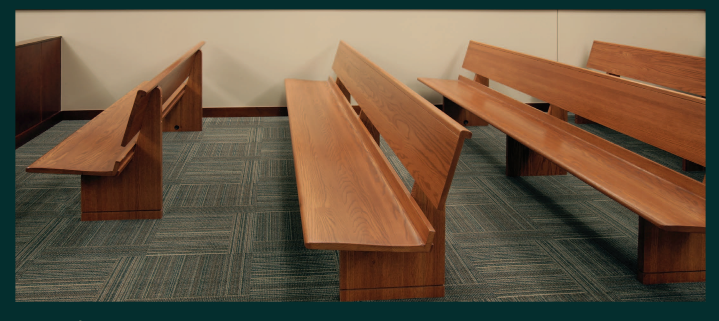
Ratigan-Schottler produces a wide range of standard solid oak bench bodies. If you're not successful in finding what you are looking for in our catalog, or have a custom design in mind, we are experts in producing custom benches from simple to complex.

All benches come with many standard features including solid oak end and center supports and a choice of solid oak ends. All benches with upholstery have been engineered with removable seats and backs for easy future reupholstering.