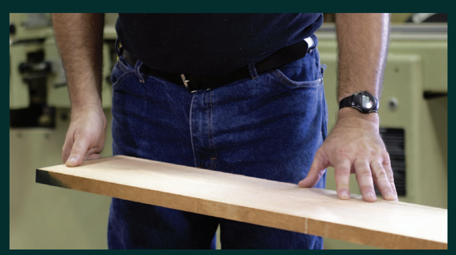
All wood used in our courtroom furniture is hand selected.

Our modular courtroom furniture is made with only the finest materials. They are available in several different styles, from simple to ornate, contemporary to traditional.