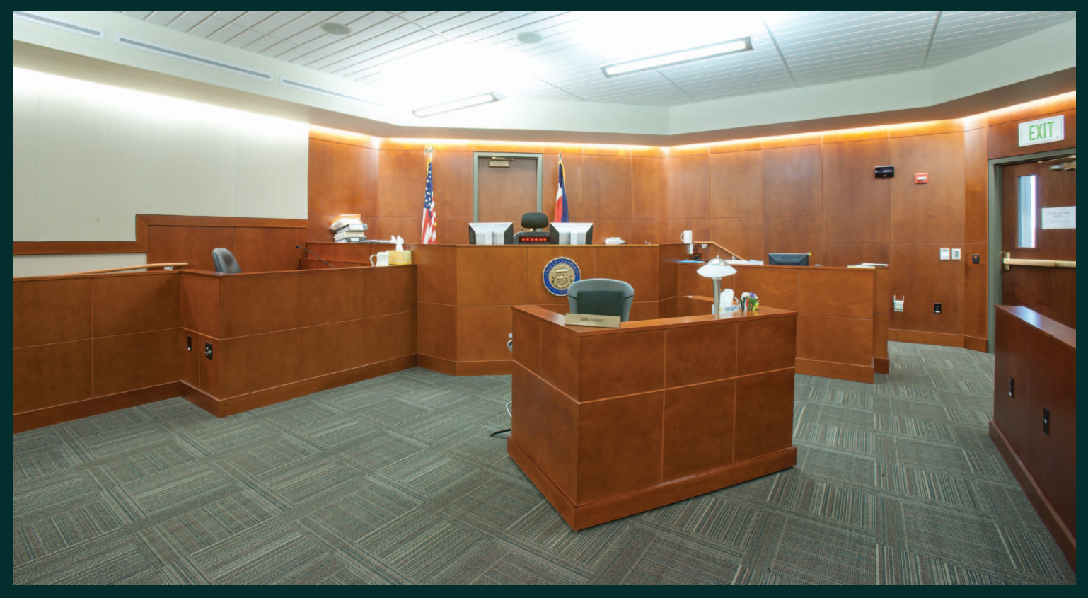
Judge's Bench, Witness Stand, Court Reporter

From contemporary to traditional the highly skilled craftsmen of Ratigan-Schottler produce furniture and architectural woodwork with great skill and care. We offer complete design services or will work in conjunction with your architect or designer to produce your custom furniture.